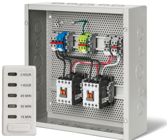
14-4710 CP-12000-2X Dual Contactor Panel w/Cover — Digital Timer included