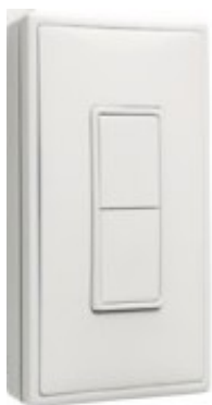
SINGLE WALL SWITCH