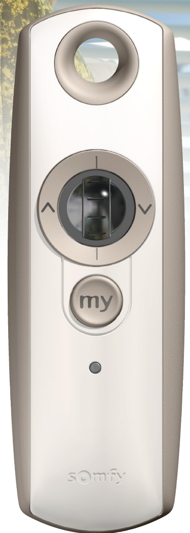
Telis 1 Modulus RTS 1 Channel Pure ACTUAL SIZE 1811234