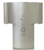
Optional clip for wall mounting

The Telis 16 RTS hand-held remote also features an optional wall clip to mount it on the wall and always know where it is and access at a moment's notice.