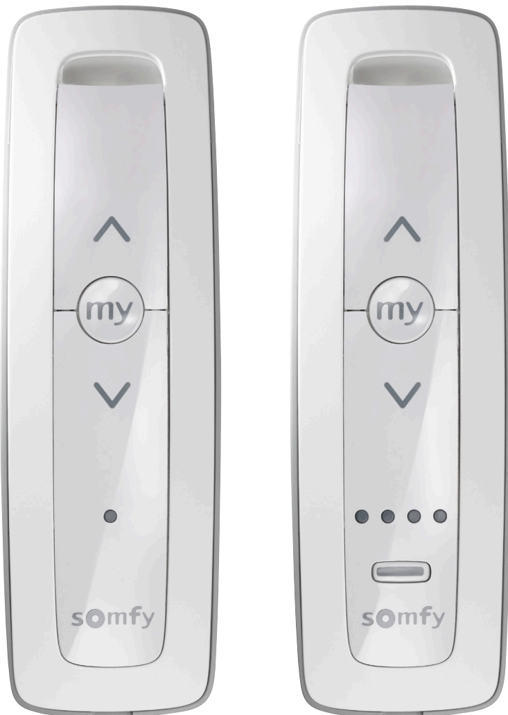
Situo® 1 RTS ACTUAL SIZE 1800128