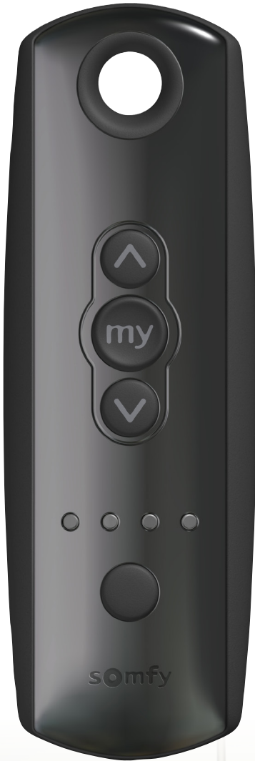
Telis 4 RTS Lounge ACTUAL SIZE 1810652