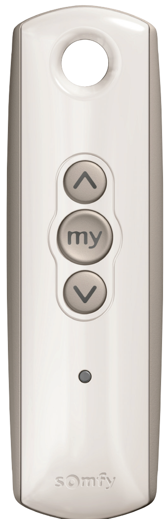
Telis 1 RTS Pure ACTUAL SIZE 1810632