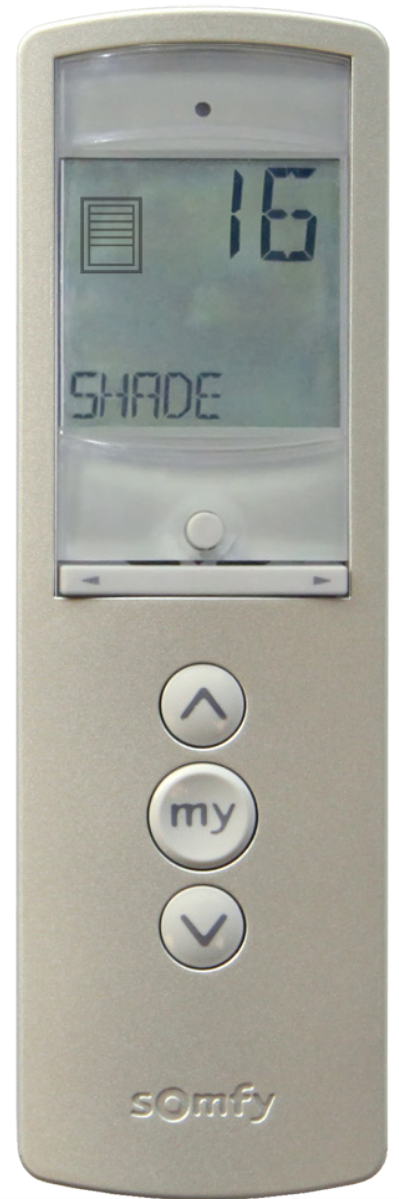
Telis 16 RTS Silver 16 Channel Hand-Held Remote ACTUAL SIZE 1811082