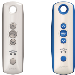
Telis Soliris RTS 1 Channel Pure 1810635 Telis Soliris RTS 1 Channel Patio 1810647