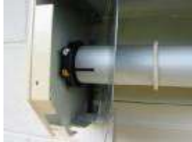
SOMFY electric motor on left side of roller shutter

At the motor end of the Roller Shutter you will see a Yellow and a White button. These are to set the stop position of the Roller Shutter at the fully open and fully closed position.