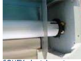
SOMFY electric motor on right side of roller shutter.

White button is to set the down limit, the yellow button is to set the down limit, yellow button is to set the upper limit. the white button is to set the upper limit.