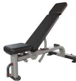
BENCHES & RACKS (13, BZ)