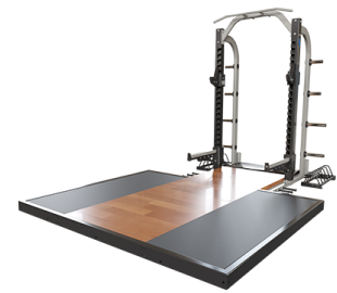
HALF RACK (19)