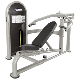
INSTINCT (13, AG)