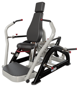
LEVERAGE (13, BZ)