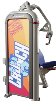
FULL DECAL TOWER