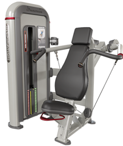
INSPIRATION (19, BZ)