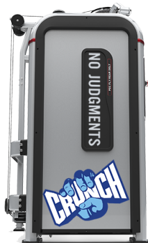
1/2 DECAL TOWER

Nautilus ONE Nautilus Inspiration Nautilus HumanSport Nautilus Impact Nautilus Instinct