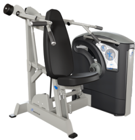
ONE (19, AG)