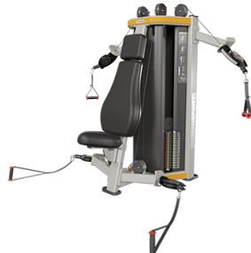
HUMANSPORT (19, BZ)