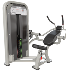
IMPACT (13, AG)