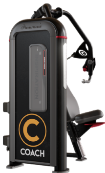
1/3 DECAL TOWER