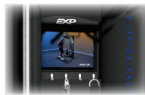
CONNECT 22 TOUCHSCREEN TABLET