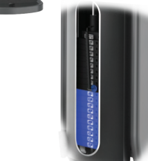
250 LB UPGRADEABLE WEIGHT STACKS