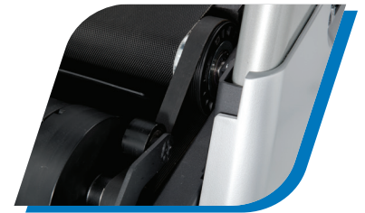
12 Groove Poly-V Belt

The CT900ENT Treadmill combines the workhorse quality and construction of the CT900 with the beauty and innovation of the entertainment display for TV, web browsing and music streaming. With a 15.6" touchscreen display, this console features intuitive function and design to make it quick and easy to get on and go. Robust construction and premium-grade components give users a smooth workout experience, while giving owners the peace-of-mind to know their equipment will live up to the rigors of consistent use.