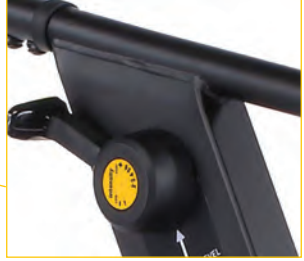
intensity lever - from free running pace to maximum