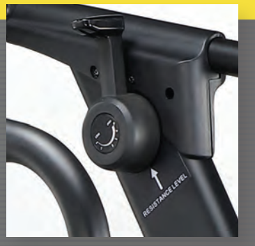
Easy To Adjust Lever

Anti-slip heavy duty rubber molded slats have exceptional durability with sealed cartridge bearings for smooth and quiet exercise.