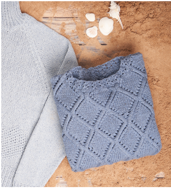
Sample size 11-12 years