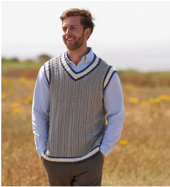
Sample size 102-107 cm (40-42")