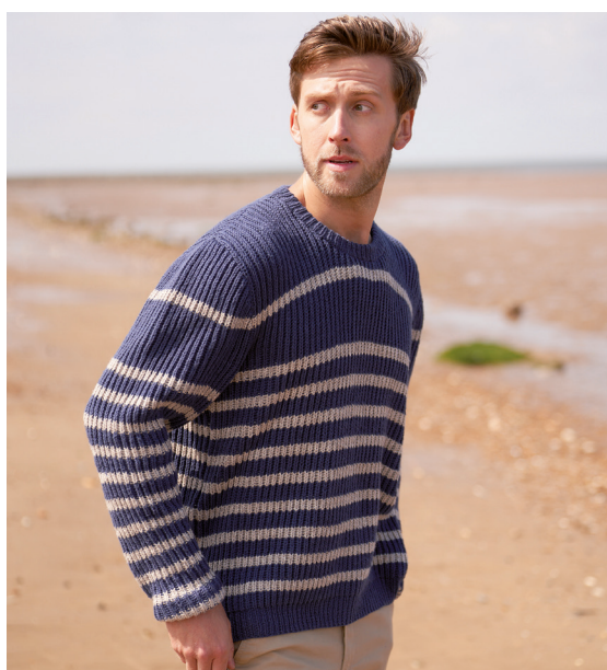
Sample size 102-107 cm (40-42")