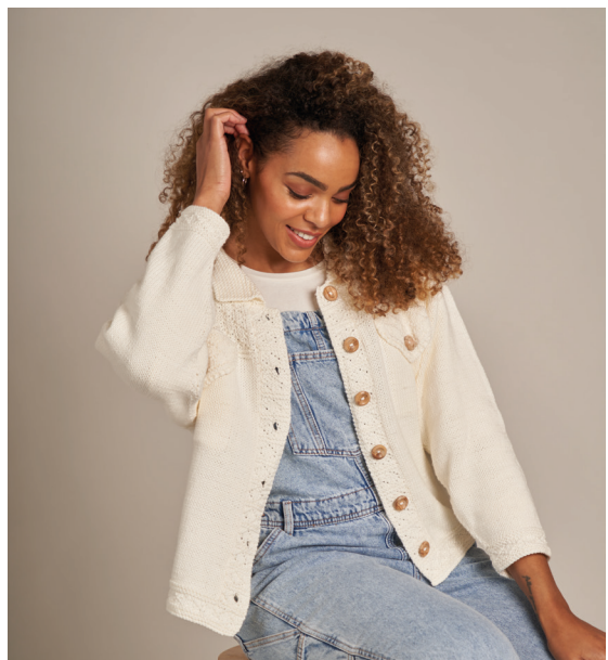
Sample size 32-34" (81-86cm)