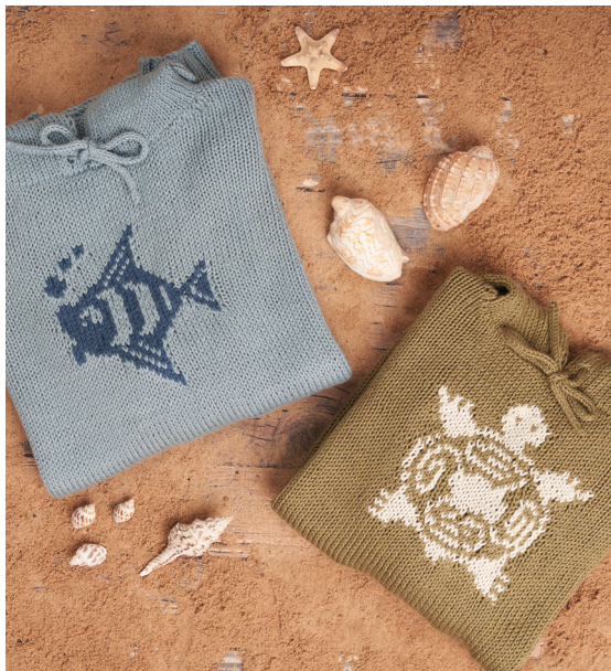
Sample size 7-8 years and 11-12 years