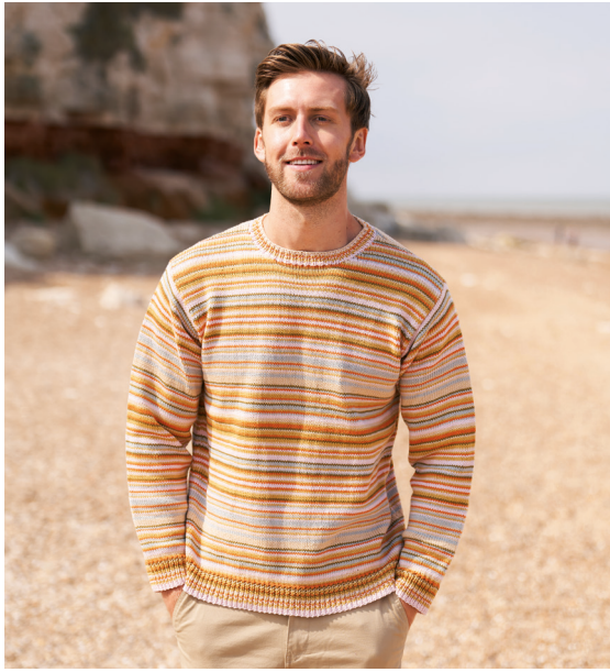
Sample size 102-107 cm (40-42")