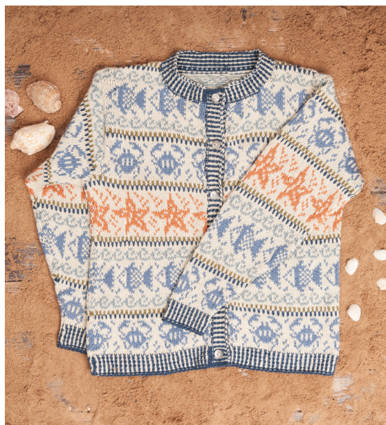
Sample size 11-12 years