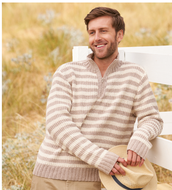
Sample size 102-107 cm (40-42")