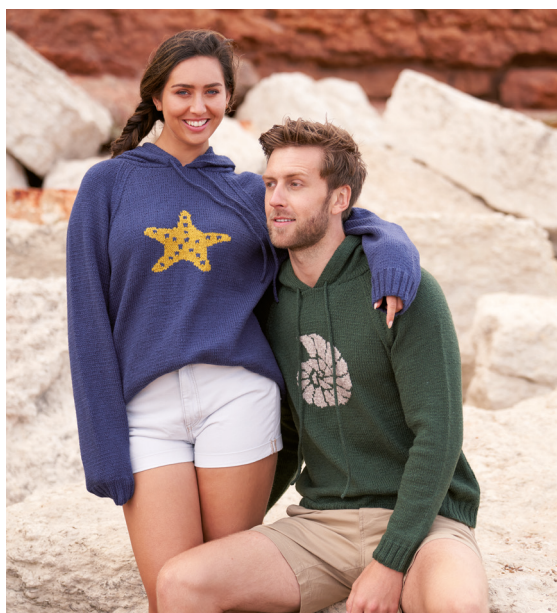
Sample size 102-107 cm (40-42")