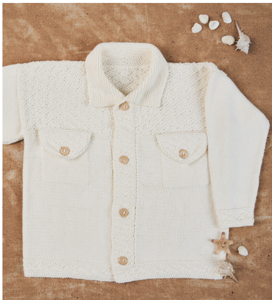
Sample size 7-8 years