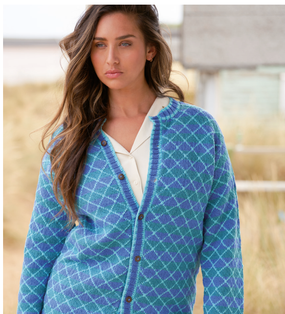
Sample size 102-107 cm (40-42")