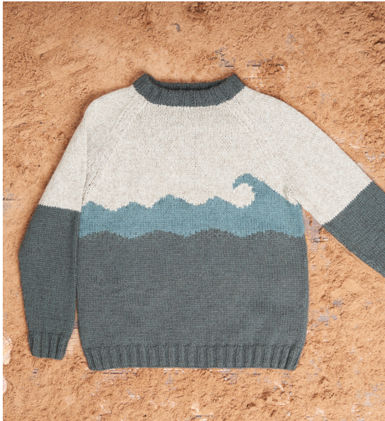
Sample size 7-8 years