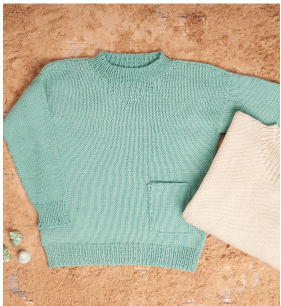
Sample size 7-8 years and 11-12 years