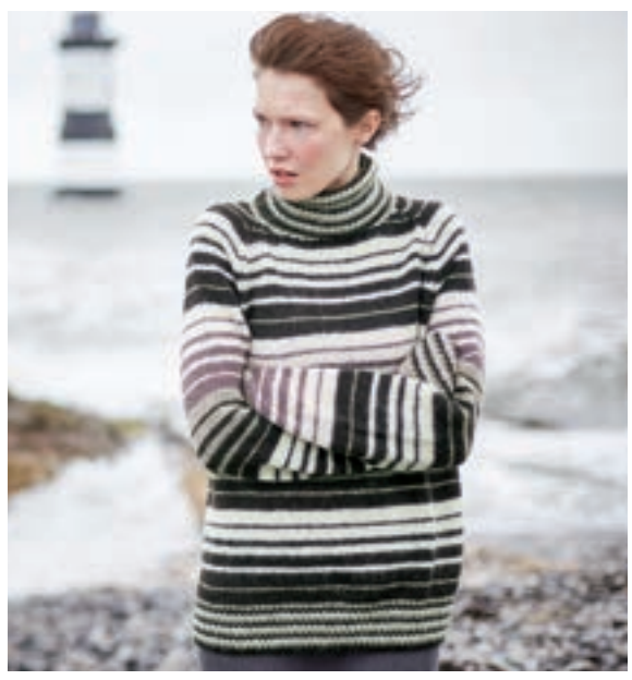
Unisex design - model shown wearing size M to give a looser fit.