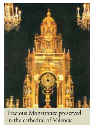
Precious Monstrance preserved in the cathedral of Valencia