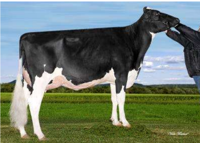
GDam: Blondin Doorman Camay