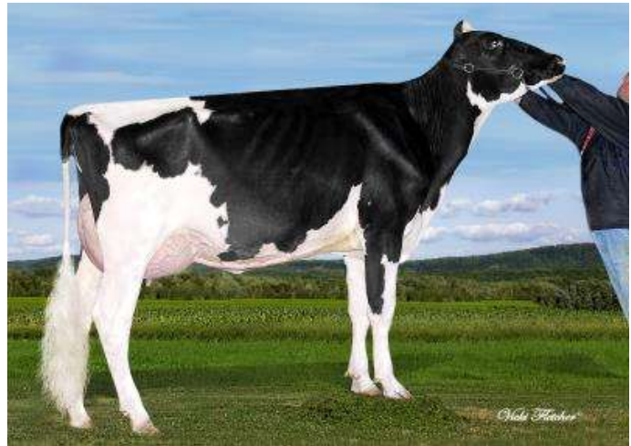
3rd Dam: MS Chassity FB Calista