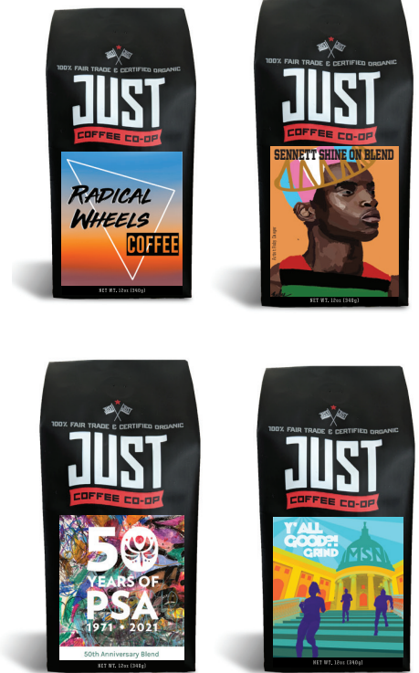
Examples of some of our great custom label fundraising partners.