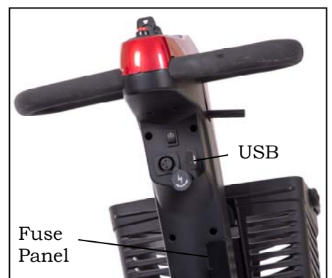
Figure 6. 1 AMP USB Charging Port

DASH/LIGHTS 1 AMP FUSE USB PORT 2 AMP FUSE XLR PORT 10 AMP FUSE