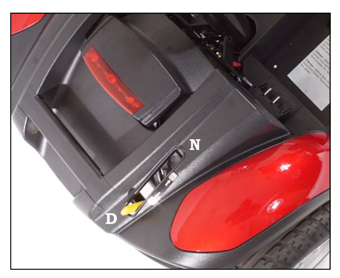
Figure 13: Freewheel Lever (Drive Position)

Your Buzzaround Luxury™ is equipped with a freewheel lever that can set your scooter in or out of freewheel mode.