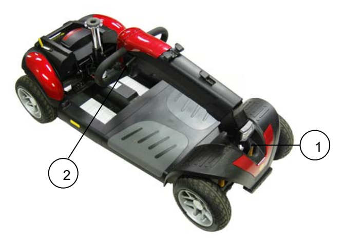
Figure 18. Lowered Tiller

6. Push in and turn the tiller lock clockwise 90 degrees. See #1 on figure 18. This will lock the front wheel to keep it from turning side to side to help control while carrying.