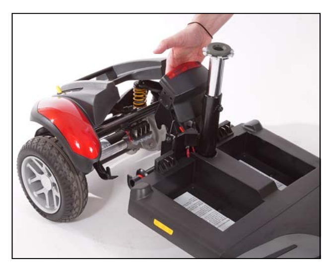
Figure 19. Separating the Drivetrain and Frame