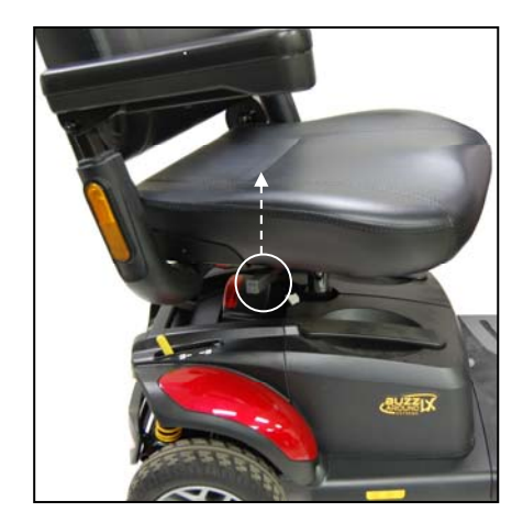
Figure 10: Seat Rotation Adjustment