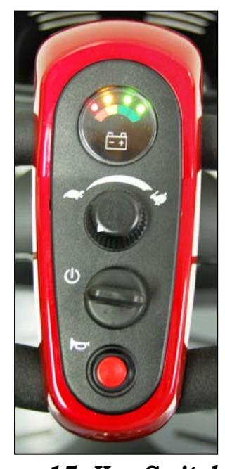
Figure 15. Key Switch (On)