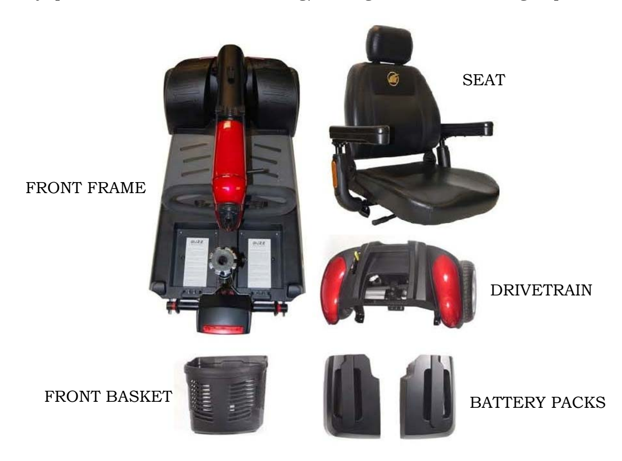
Figure 20. Buzzaround Luxury™ Components (Model GB149)

Ensure that all components in the scooter have been correctly assembled. During assembly, please check that all connecting/locking devices are holding in place.