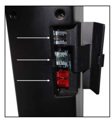
Figure 7. Fuse Panel

DASH/LIGHTS 1 AMP FUSE USB PORT 2 AMP FUSE XLR PORT 10 AMP FUSE