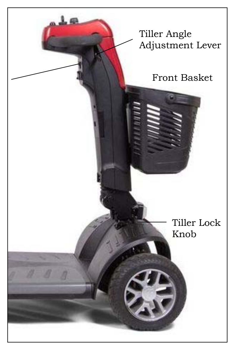
Figure 24. Tiller Raised