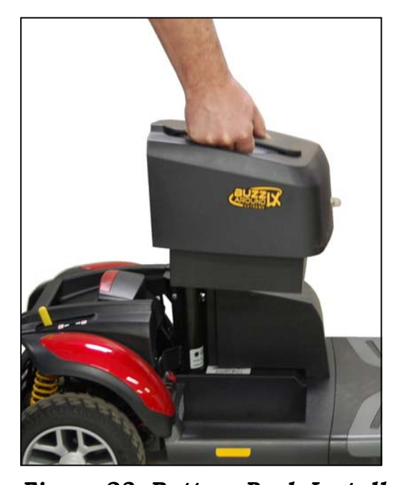
Figure 23. Battery Pack Installation