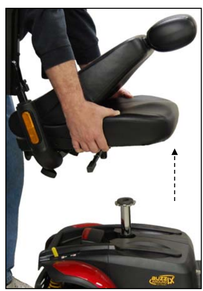
Figure 16. Removing the Seat

3. Grip the seat on opposite sides and, with a firm grip; pull the seat straight up. See figure 16.