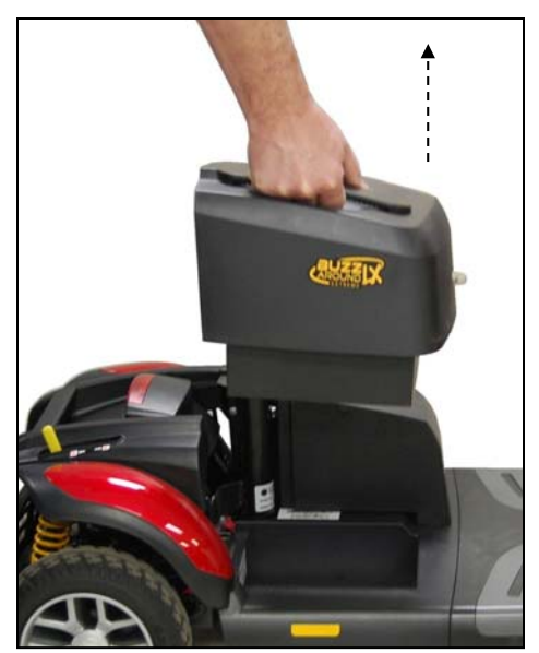
Figure 17. Removing the Battery Pack