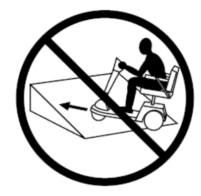
Figure 3. Traversing an Incline

WARNING If, while you are driving down a slope, your scooter starts to move faster than you feel is safe, release the throttle control lever and allow your Buzzaround Luxury to come to a stop. When you feel that you again have control of your scooter, push the throttle control lever forward and continue safely down the remainder of the slope.