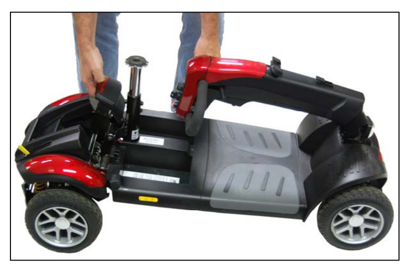
Figure 22. Connecting Frame and Drivetrain