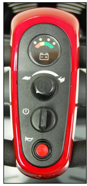
Figure 14. Key Switch (Off)