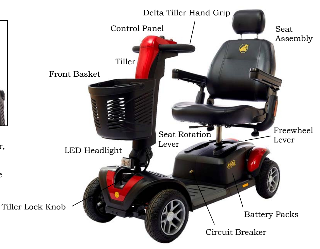
Figure 4. Your Golden Buzzaround Luxury™ (Model GB149)

Tiller angle adjustment lever, headlight/taillight switch, XLR battery charging port, USB charging port, and fuse panel.