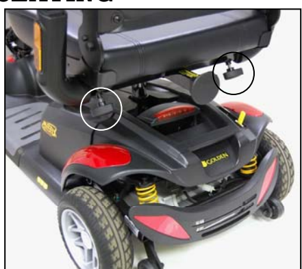
Figure 8. Armrest Width Adjustment