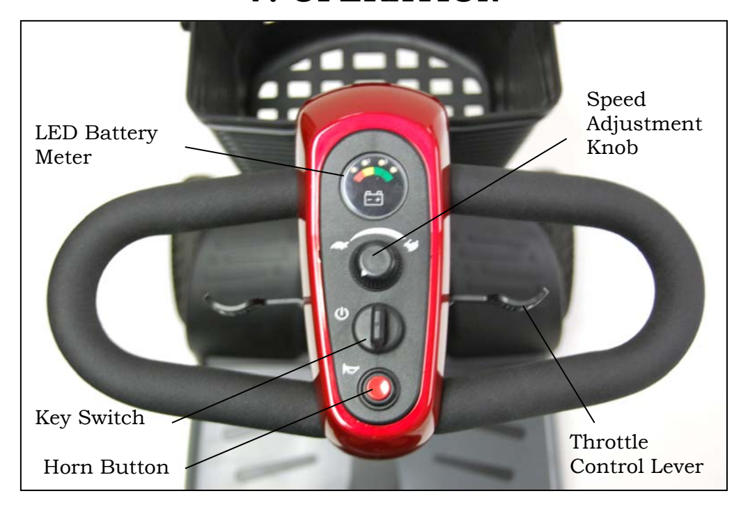
Figure 5. Buzzaround Luxury<sup>TM</sup> Delta Tiller Control Panel