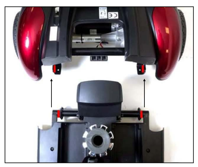
Figure 21. Drivetrain Alignment

3. Gently lower the battery packs one at a time onto the frame. See figure 23.