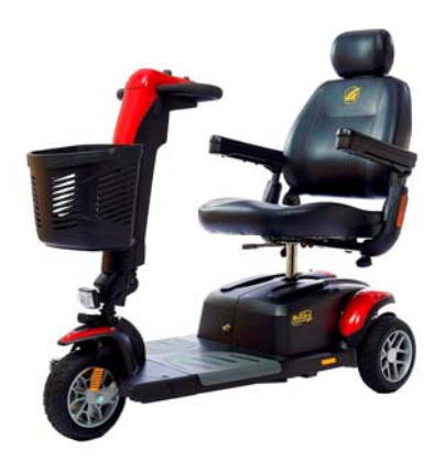
Figure 26. Buzzaround Luxury<sup>TM</sup> (Model GB119)

All Golden Buzzaround Luxury scooters can be equipped with docking devices for loading onto a vehicle by means of a mechanical lift or hoist. Contact your Golden Technologies, Inc. provider for more information concerning docking devices and scooter lift devices.