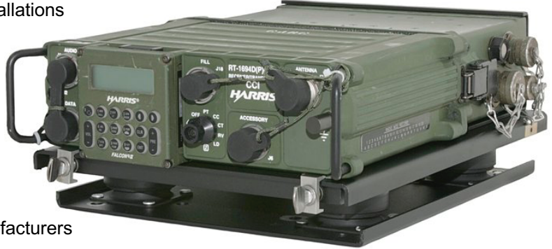
Part #: TSE-RM-2