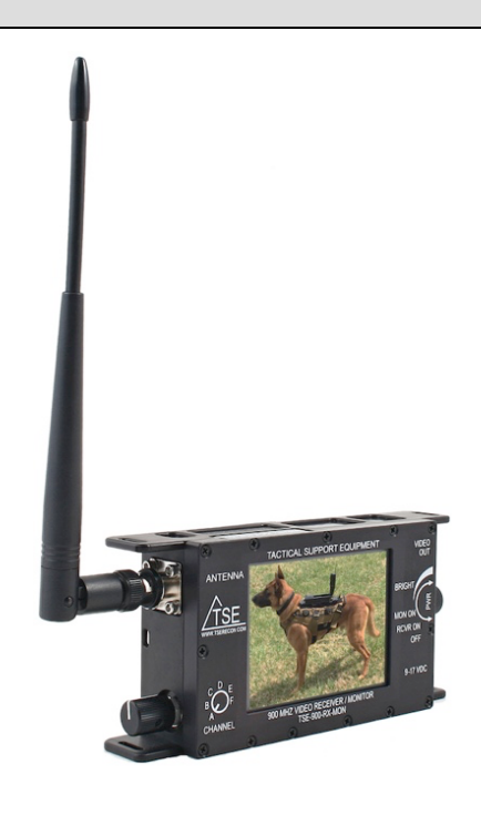
Part #: TSE-900-RX-MON

The video receiver adds versatility to surveillance missions that require rugged, easy-to-use, space-saving video receivers. The receiver provides the user with a video output connector to display the video on a larger screen. The receiver's LCD has adjustable brightness for tactical low light applications. The receiver is rechargeable and has low power consumption.