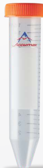
15 ML 17000 g