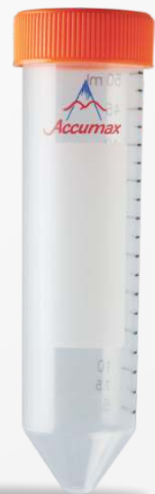
50 ML 20000 g