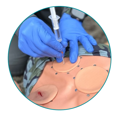
Relief puncture according to Monaldi