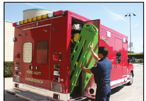
Fits in a standard backboard compartment