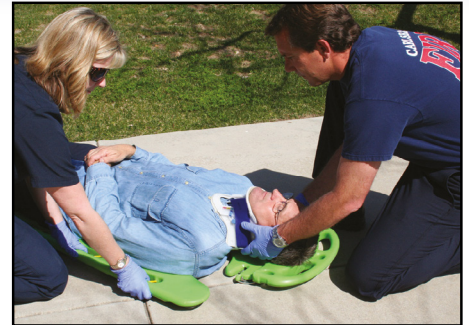
Functions like a scoop stretcher