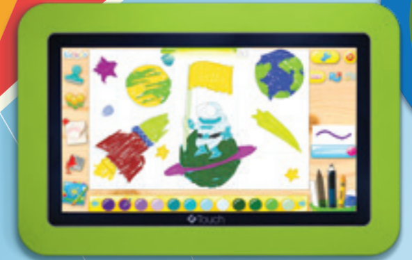
Genee Play Screen 42"

The Genee Early Years Play Screen Range is a great addition to any Preschoolers right up to the end of Key Stage 1 and 2 classroom with objectives of engaging students using educational gaming software to inspire learning.