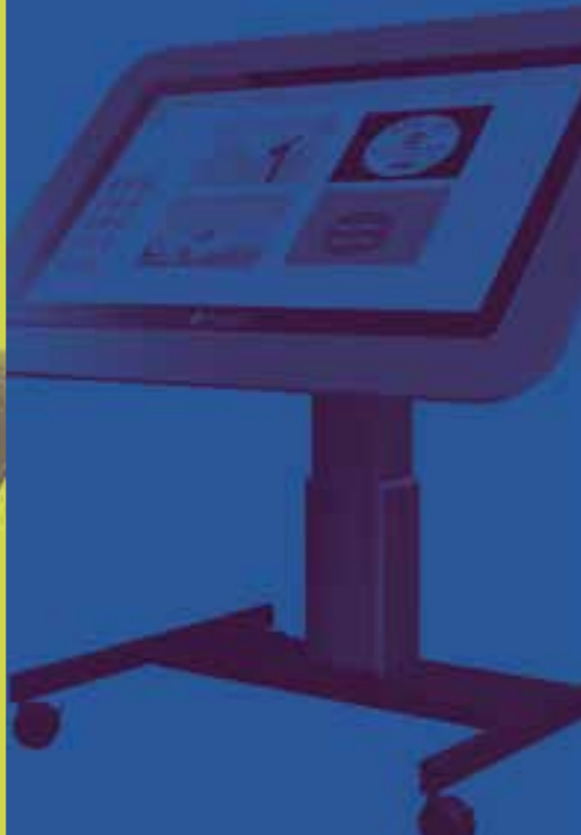
43" Junior High-Low Tilt and Touch Table