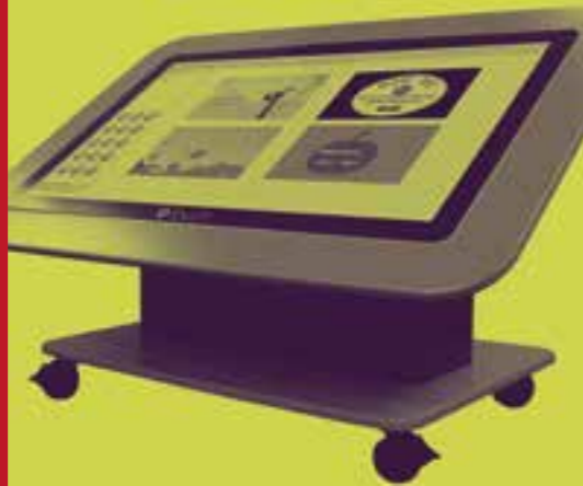
43" Junior Tilt and Touch Table