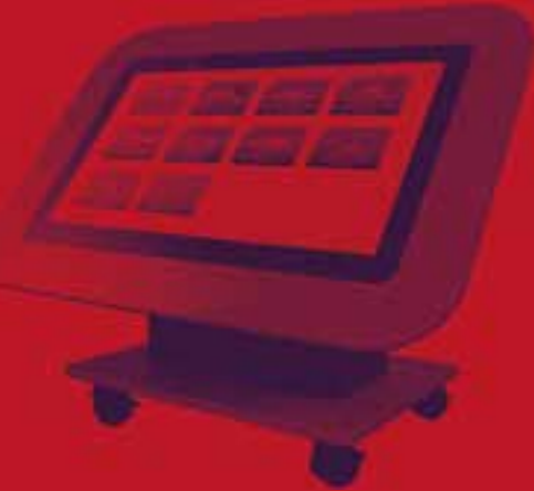
32" Early Years Tilt and Touch Table