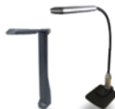
Genee Vision Wireless Visualisers