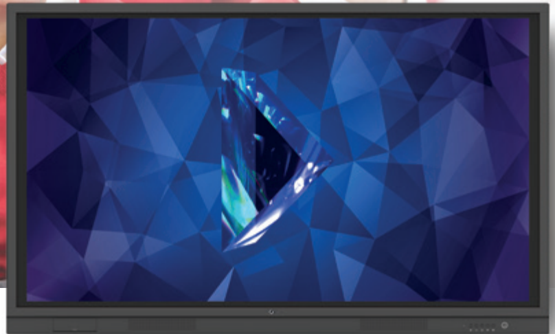
G-Touch® Sapphire 65", 75" & 85"

The all-new Sapphire now with 4K technology! Designed for the digital classroom, the 4K Sapphire is an easy to use but powerful solution to engage students and empower teachers. As a leading manufacturer of touchscreens, we work closely with educational institutions to establish their needs and requirements. All of our G-Touch® range of touchscreens are Windows, Mac compatible.