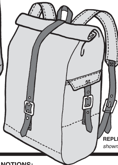
REPLICA BAG shown with rolled top

Without pockets: LEVEL 1—Quick & EASY With pockets: LEVEL 2—EASY