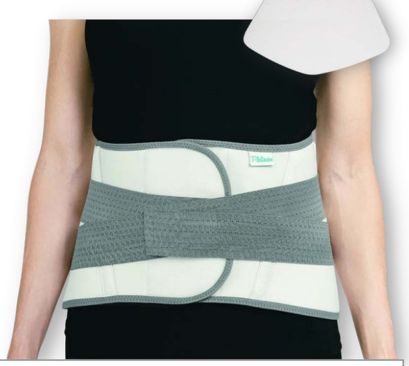
Available with or without Heat Mouldable Rigid Back Support Panel 🔻

Low back sprains/strains, mild lumbar disc injury.