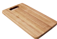
CB 932 Chopping Board