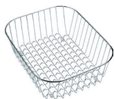
DB 448 Drainer Basket