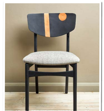
COPPER LEAF finished with CLEAR CHALK PAINT® WAX