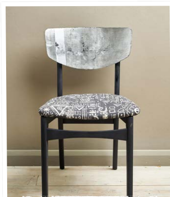
IMITATION SILVER LEAF finished with BLACK CHALK PAINT® WAX

Available in IMITATION SILVER, IMITATION GOLD & COPPER.