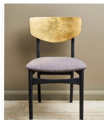
IMITATION GOLD LEAF finished with GLOSS CHALK PAINT® LACQUER