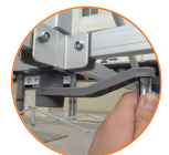
Wind-up Peak Pole