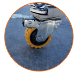
Heavy Duty Transportation Wheel