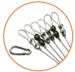
Hooks and Wires