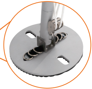
Nylon Fiberglass Foot Pads