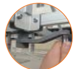
Wind-up Peak Pole