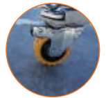
Heavy Duty Transportation Wheel