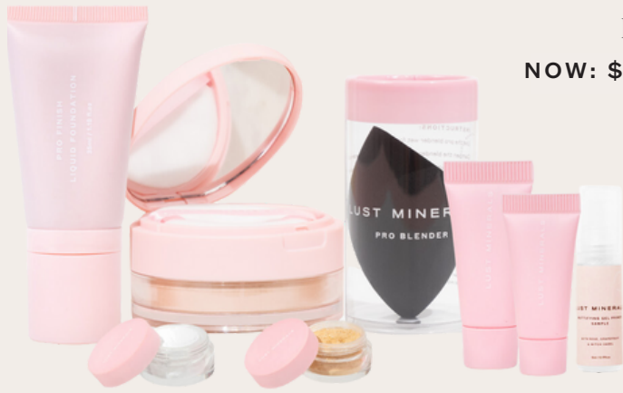
Perfect Match Pack