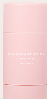
Natural Stick Deodorant