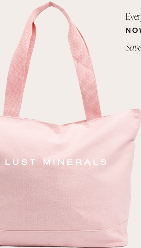
Everyday Tote Bag