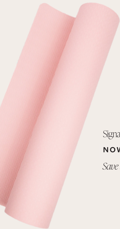
Signature Yoga Mat