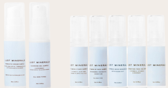
Skincare Try It All