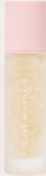
24k Gold Flakes Mineral Primer