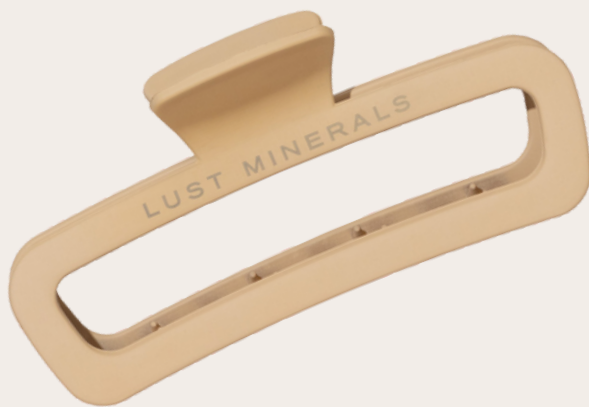
Lust Minerals Signature Claw Clip