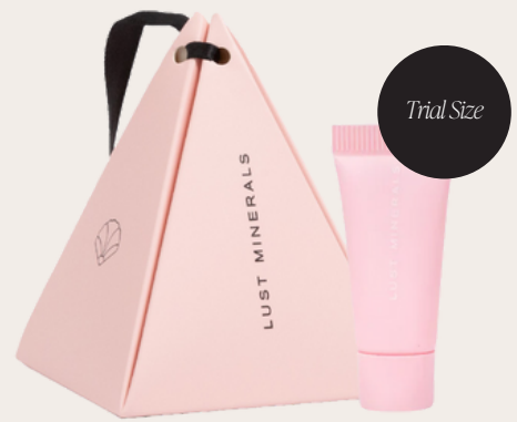
Mineral Primer with Christmas Tree Beauty Ornament