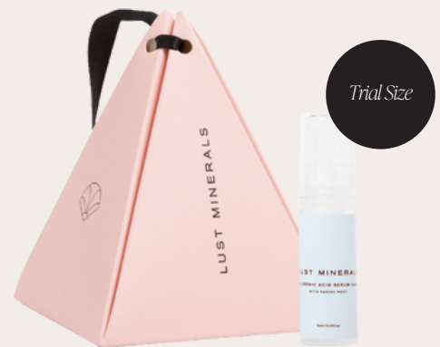
Hyaluronic Acid Serum with Christmas Tree Beauty Ornament