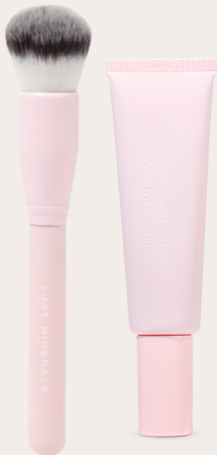
Clean Glow Kit - SPF50