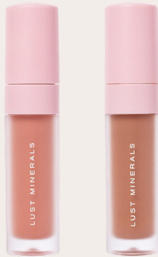
Lip Gloss Duo