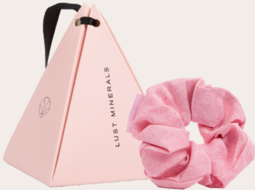
Signature Scrunchie with Christmas Tree Beauty Ornament