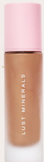
Clean Girl Edit