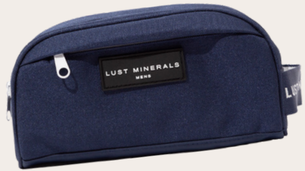
Mens Travel Bag- Blue