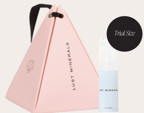
AHA Exfoliating Lotion with Christmas Tree Beauty Ornament