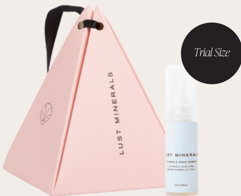
Vitamin C Brightening Serum with Christmas Tree Beauty Ornament