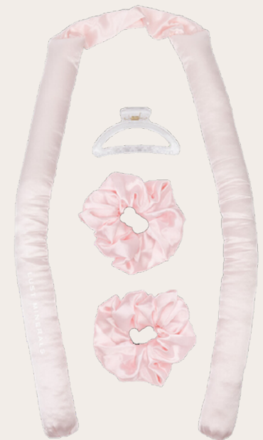
Heatless Hair Curling Set