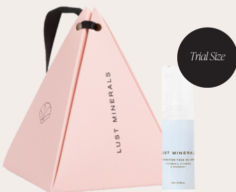
Rejuvenation Oil with Christmas Tree Beauty Ornament