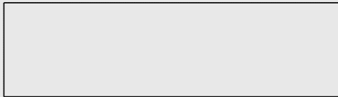
ELEVATION - FRONT