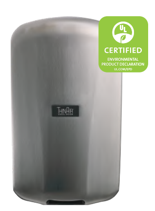
TA-SB Brushed Stainless Steel