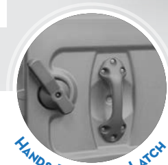
HANDS-FREE DOOR LATCH