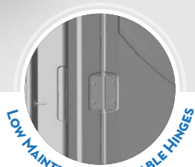
LOW MAINTENANCE, DURABLE HINGES