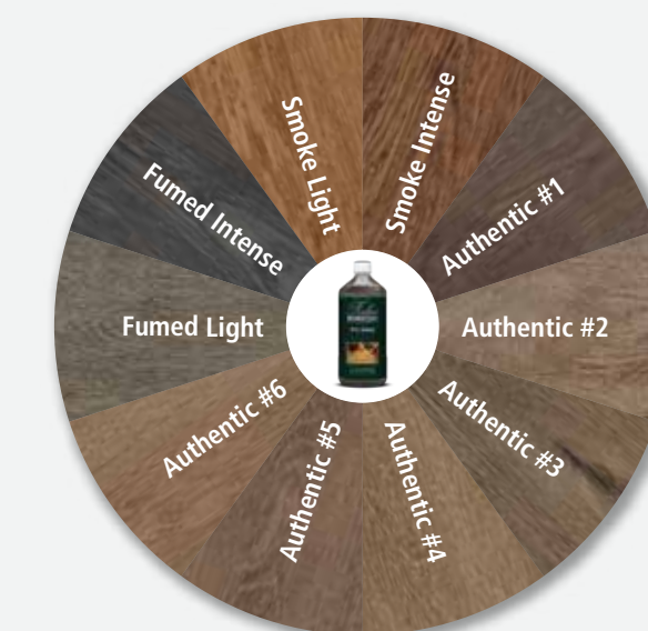
The colors shown are on White Oak and are for reference only and are not binding.

Rubio® Monocoat Pre-Aging is a high-quality, non-reactive pre-treatment, that gives wood an aged appearance. Application provides a deep color with subtle accents. Available in 10 shades, the color spectrum ranges from a lighter to a darker smoked look, with colors that can be mixed with each other to create custom looks.