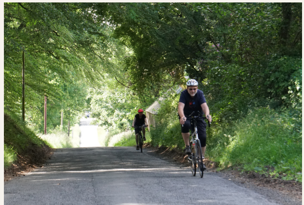
Cycling is a popular passtime for many locals

You can hire a bike from Bespoke Cycles in Peebles.