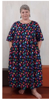
Size worn 22 My measurements

*Ease: The Millican Frock is larger than the measurements above (except length). The measurements above are the body measurements that fit comfortably into each size.