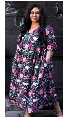
Size worn 18 Measurements

Height 173 cm Bust 114 cm Shoulder 40 cm Middle 95 cm Waist 96 cm Hips 126 cm Bicep 39 cm Arm Length 51 cm