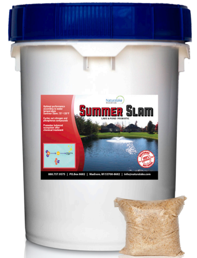
Summer Slam is available in 10 and 30 pound containers.