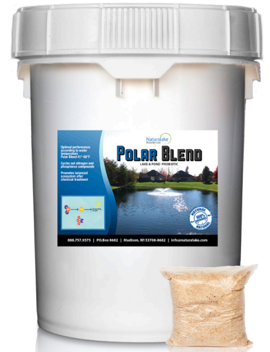
Polar Blend is available in 10 and 30 pound containers.