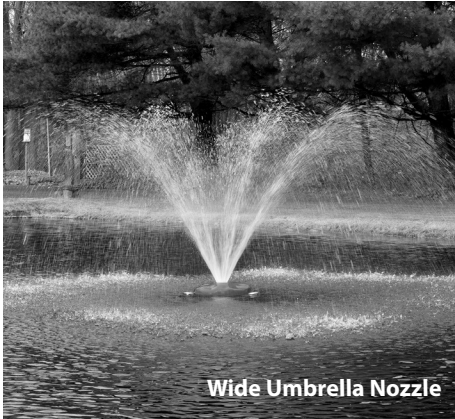
Wide Umbrella Nozzle