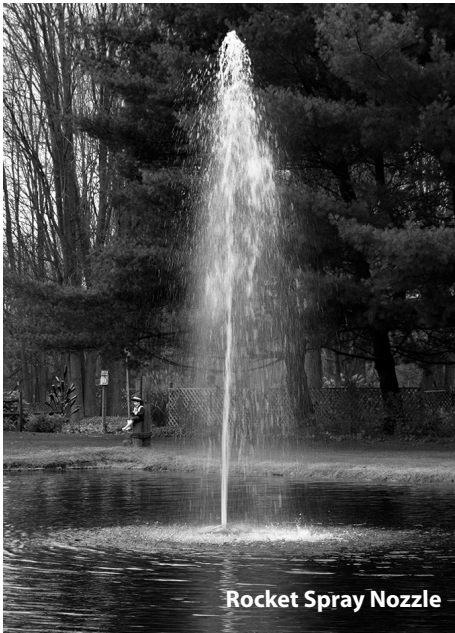
Rocket Spray Nozzle