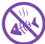
Helps reduce odors and chemical contaminants