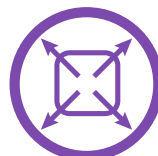
Purifies up to: 2,000 sq.ft.