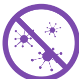
Helps reduce germs