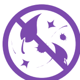
Helps reduce volatile organic compounds (VOCs)