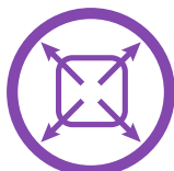
Purifies up to: 900 sq.ft.