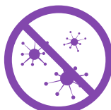
Helps reduce germs