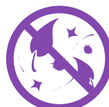
Helps reduce volatile organic compounds (VOCs)