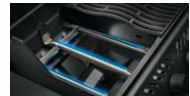
Durable cast aluminum fire box