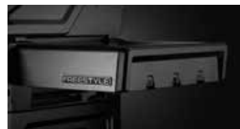
Folding side shelves with integrated tool hooks