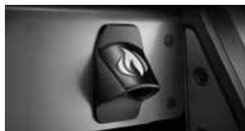
Integrated bottle opener