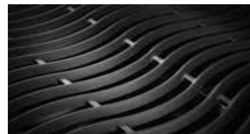
Porcelainized cast iron Iconic WAVE™ cooking grids