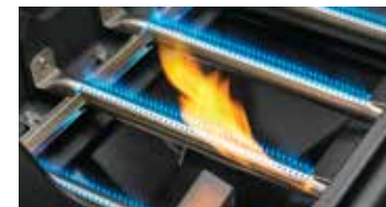
Instant JETFIRE™ ignition with cross-over lighting