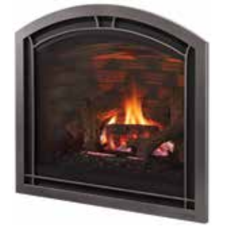
IRON AGE available in black, graphite and new bronze