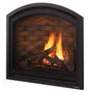
FIRESCREEN available in black, graphite and new bronze