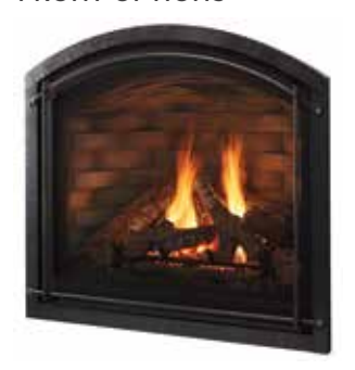
CHATEAU FORGE available in hand-crafted hammered steel