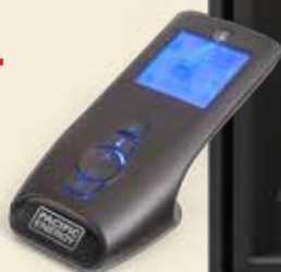
Remote control included