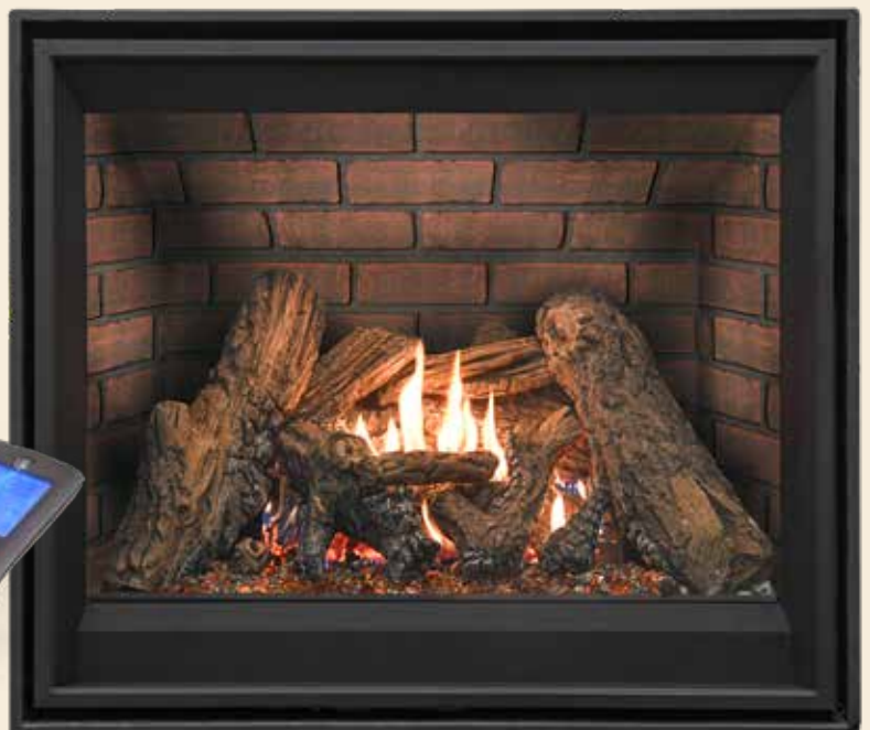
Premium Model with optional Red Brick Firebox Panels