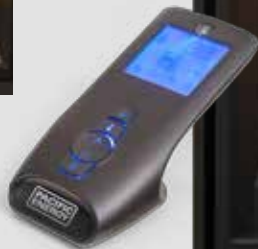
Remote control included