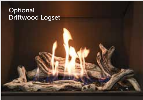
Optional Driftwood Logset

Tofino z25 is offered as a fully assembled fireplace with painted black steel firebox panels and a sparkling black glass burner. Upgrade your Tofino z25 with a Driftwood logset, four firebox panel options, and a 120 cfm variable speed blower.