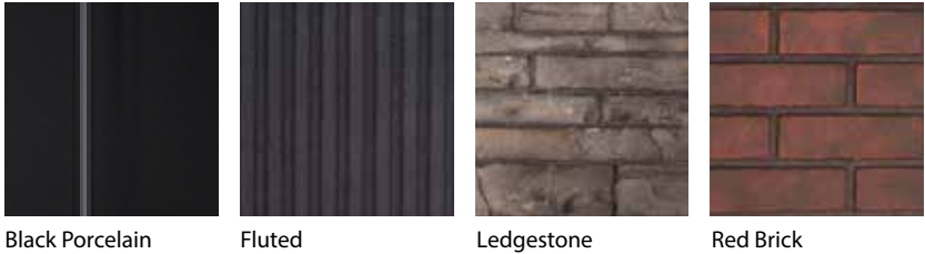
Black Porcelain Fluted LedgeStone Red Brick