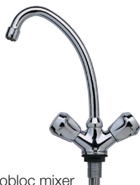
UB1 Monobloc mixer