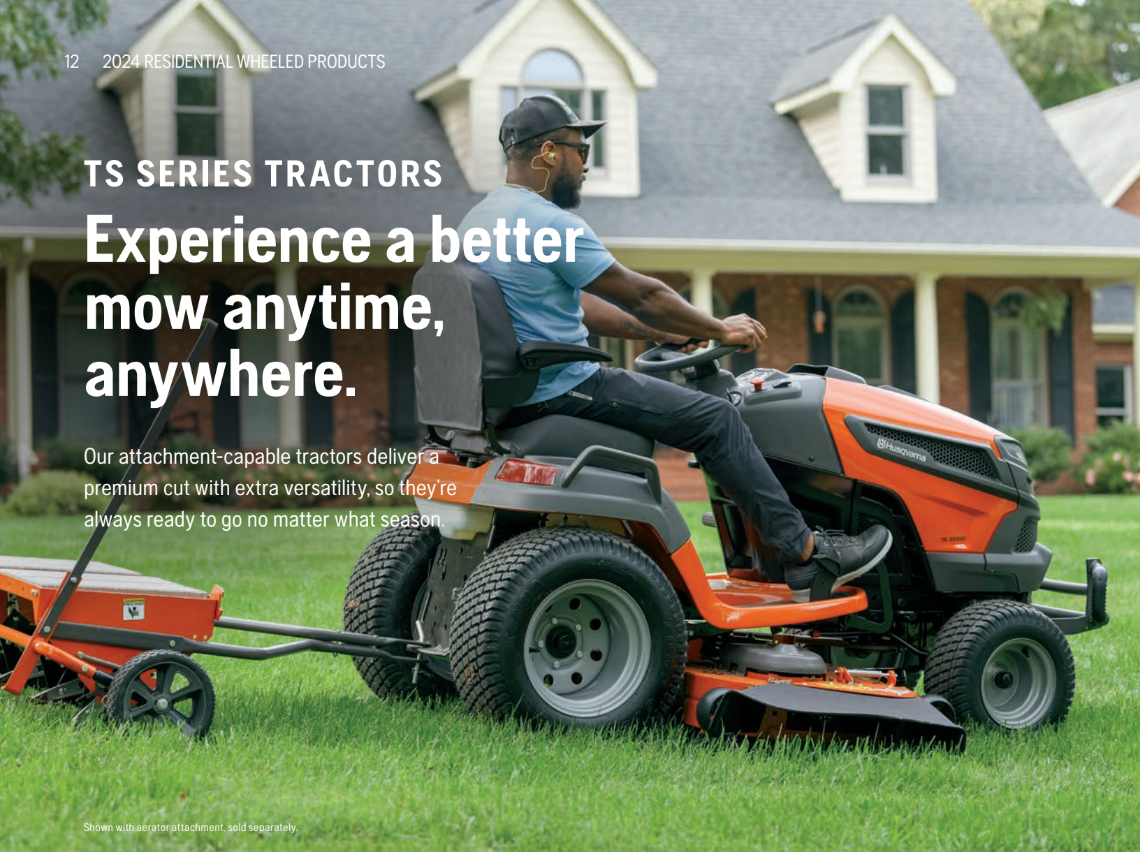
Shown with aerator attachment, sold separately.

Our attachment-capable tractors deliver a premium cut with extra versatility, so they're always ready to go no matter what season.