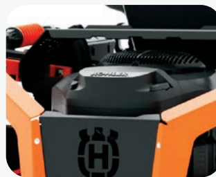
Premium Kohler engines