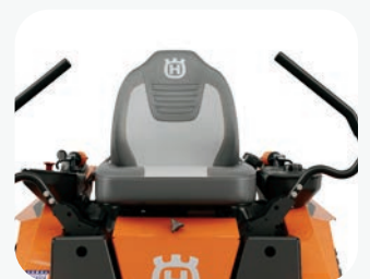
High-back 18" seats