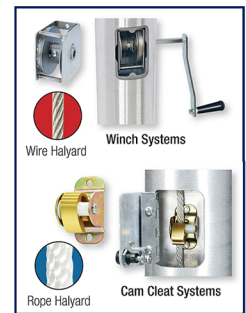
Internal (w/ Lock Box)