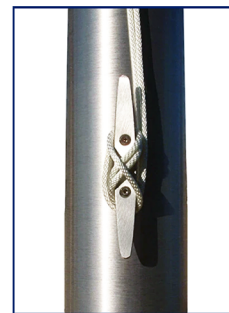
External (w/ Cleat)

Let us help you choose the right flagpole for your individual needs and style!