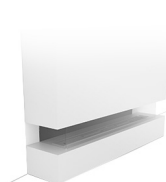
Three - Sided