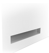
Single - Sided

Unique firebox solution - ready to be installed in the wall opening in 6 different shapes.